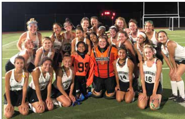
Varsity field hockey is just one of the fall sports taking place at Wakefield High School this season.

The award-winning choir has their fall concert on Wednesday, October 16, at 7 pm in the auditorium. Of course, you can also see and hear the Wakefield band march through our neighborhood when they lead the Abingdon Halloween Parade (see page 23 for details).