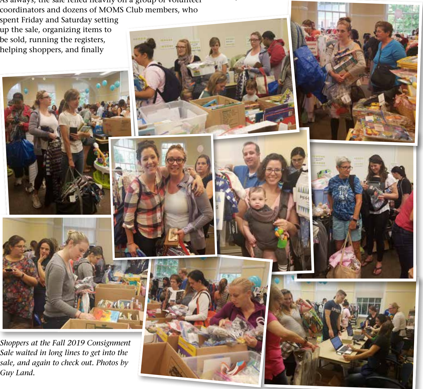
Shoppers at the Fall 2019 Consignment Sale waited in long lines to get into the sale, and again to check out.