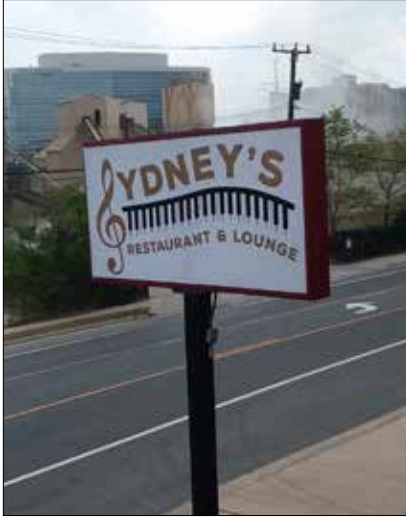
Sydney's Restaurant and Lounge on Shirlington Rd. opened in July.

The Shirlington area has added another new restaurant, as Sydney's Restaurant and Lounge opened to the public over the summer. Located at 2620 Shirlington Rd. (at the previous location of Chester's Billiards), Sydney's goal is to have a diverse crowd from all local neighborhoods to enjoy a new establishment that offers an American cuisine with a Caribbean flair.