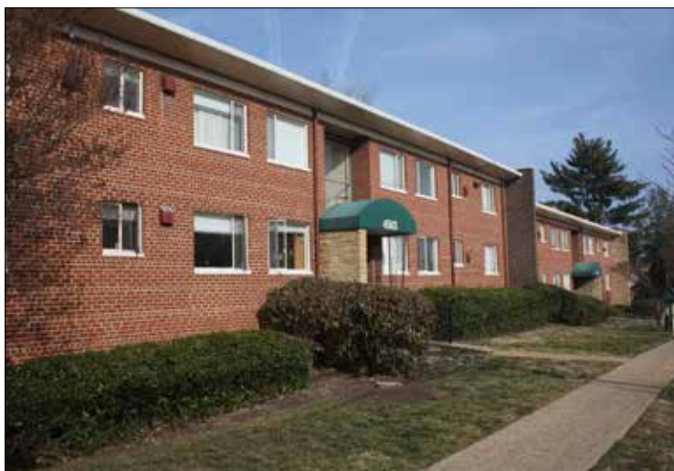
Park Shirlington is a 294-unit garden apartment complex built in 1956 and is currently maintained as affordable housing.

One option under consideration by the owner would see