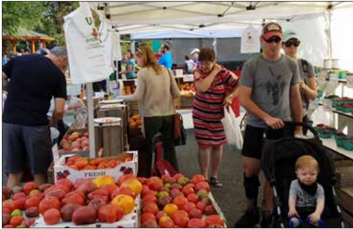
Fall is a busy time at the market with special events, activities for kids, and lots of fresh produce and specialty items.

Help is needed setting up the information tent before the market opens and putting supplies away when it closes, answering questions from shoppers, and assisting with special events. Vendors handle their own set up and sales. Thank you to the Fairlington residents who have volunteered this year!