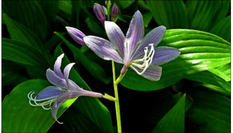
Hostas are a popular choice for patio gardens due to their resilience and versatility.

Hosta is popular but thrives in our climate—blistering sun or full shade. And they tolerate drought. But some cultivars can be big (not tall but up to two feet wide) which takes up your valuable space in a Fairlington patio garden. Why not keep a hosta "here and there" while leaving space