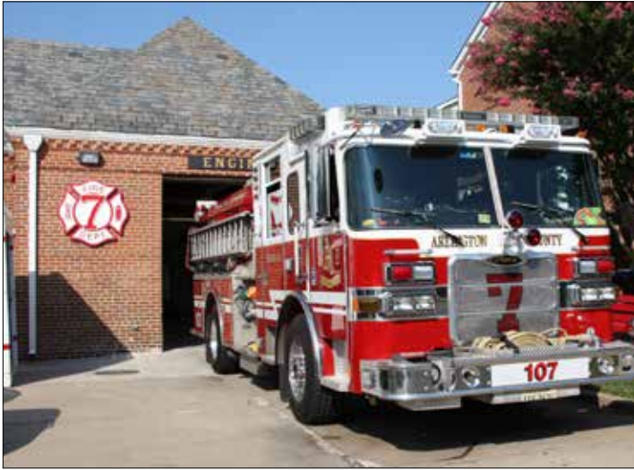
Fire Station 7 has been temporarily closed since October, 2018.