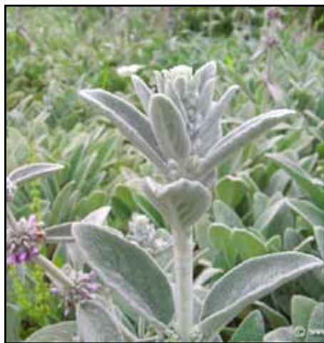
Lamb's ear.

Playwrights, poets, and songwriters nurture their imagination staring into the garden. They also draw inspiration from it, employing landscape-derived images and figurative language to make vivid statements like the following: