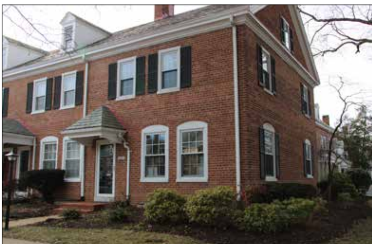
This Dominion unit in South Fairlington recently set a sales price record for Fairlington at $729,500.

Overall, the total assessed value of all residential and commercial property in Arlington increased only 2.2 percent, compared to the 4.6-percent growth in 2020. Residential property values increased 5.6 percent overall, while