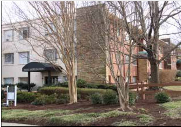
Park Shirlington Apartments on S. 31st St.

The Arlington County Board has unanimously voted to exercise its option to purchase the south parcel of the Park Shirlington Apartments property on S. 31st St. The parcel lies between S. 31st St. and I-395. The board's action is part of an effort to provide long-term committed affordable housing at the site. The purchase price under the option is $27.9 million.