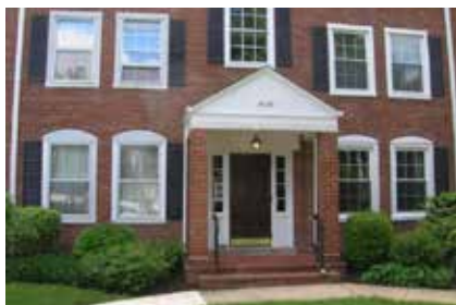
3028 S Abingdon St #B2 Arlington, VA 22206 1BR/1BA *Braddock Model*