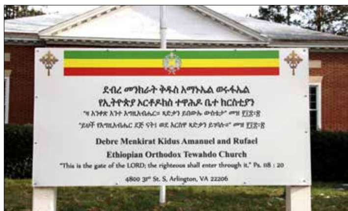
A large sign outside of the old Long & Foster building announces the arrival of a new neighborhood church.

The Ethiopian Orthodox Tewahedo Church (EOTC) community purchased the vacant building in North Fairlington at 4800 31st St. S., which was formerly owned by Long & Foster Real Estate. The community bought the building in December 2020 and are currently holding weekend services.