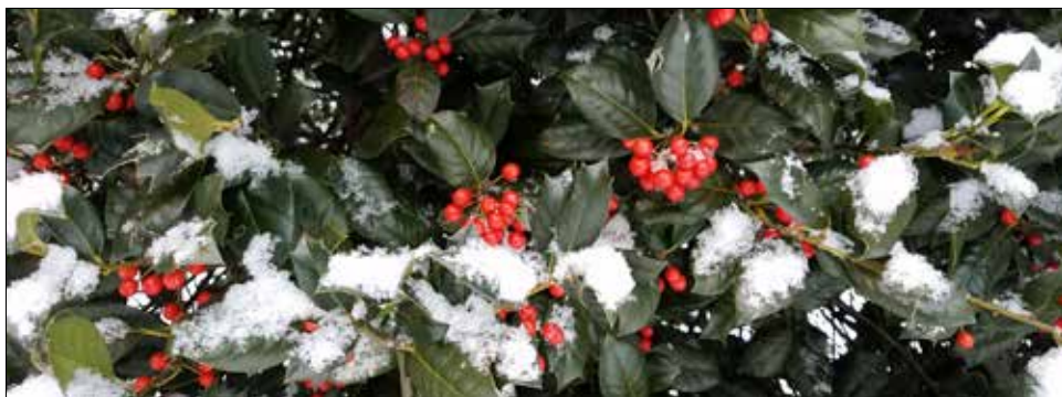
Bright holly berries peep out amid snow in Fairlington.

False cypress: It can be tallish but there is a dwarf, pendulous cultivar that grows 2 feet tall with a similar spread. The lacelike, green foliage is tinted yellow in some cultivars and spills downward like an inverted mop. No other specimen has this growth habit—soothing and pleasant, like a miniature waterfall.