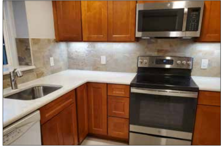
The Harvest Gold of a 1970s kitchen has given way to new backsplash, cabinets, and stainless steel appliances.