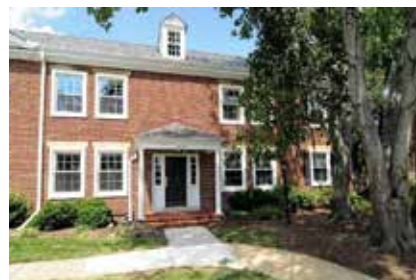
4627 A-2 36th St S #1695 Arlington, VA 22206 2BR/2BA *Barcroft Model*