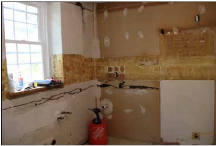
A kitchen in an apartment-style unit is stripped to the bare walls as part of a renovation project this fall.

The first effort will be a virtual event series that features experienced contractors who have significant experience working in Fairlington homes.