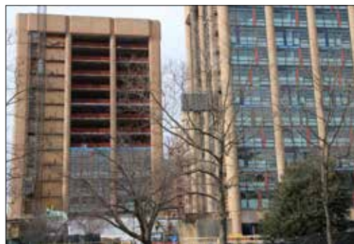
Work is well underway on converting the two office buildings at Park Center Dr. and Ford Ave. to apartments.

Conversion of the two buildings is well underway, with apartment leasing planned to begin later this year. The project will also update and enhance existing open space