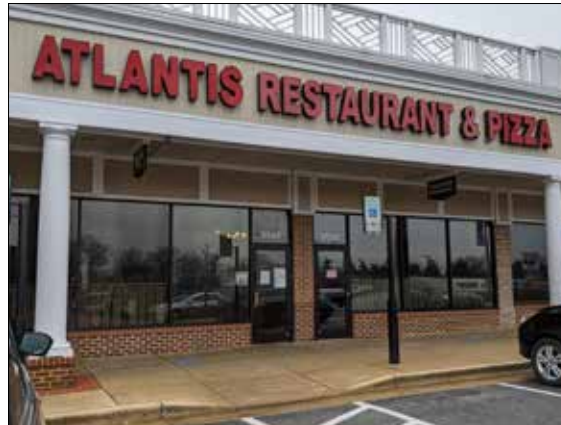
Atlantis Pizzeria and Family Restaurant with locked doors and dark windows after its final day in operation: January 24, 2021.

Terry Placek, a Fairlington resident since 1977 and presi-