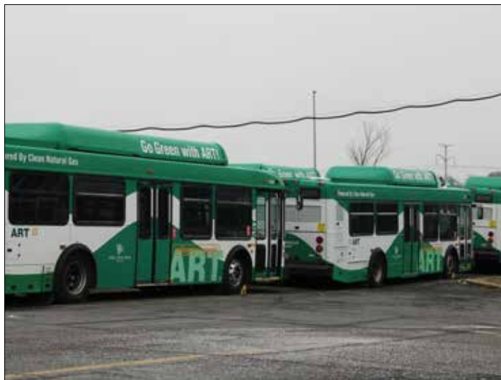
The ART bus parking lot, next to the CubeSmart self-storage building on Shirlington Rd., will become the site of a new maintenance facility and administrative offices.

Arlington county will be building a new facility in the industrial area adjacent to Shirlington Rd. (2631 and 2635 Shirlington Rd.) to support the needs of Arlington Transit (ART), Arlington's local bus service. The project will support operations, maintenance, parking, and administration of the county's growing ART bus fleet and transit operations. ART has been using the site since 2017.