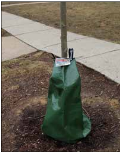
Arlington County often provides Treegator® slow release watering bags for newly planted trees, as in this planting on S. 30th St.