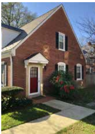
3010 Abingdon St #B2 Arlington, VA 22206 2BR/2BA *Edgewood Model*