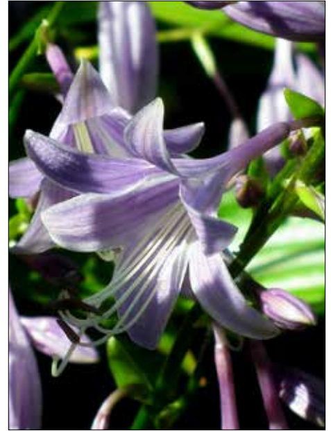
Hostas are a shade-loving perennial.

Low-maintenance wanted: This means little to no pruning, leaf pick-up or transplanting. Most perennials are easy to care for. Annuals (planted in pots) don't need much attention (aside from watering during summer). Annuals will provide flower color from late April until the second frost in early December.