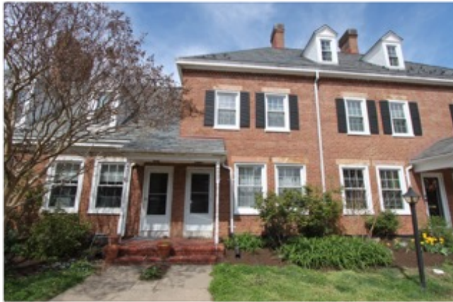
4337 S. 36th Street

Well-cared for Clarendon with tall attic sold over the list price just days after the 1st open house. Multiple offers received. Call today for details. $505,000