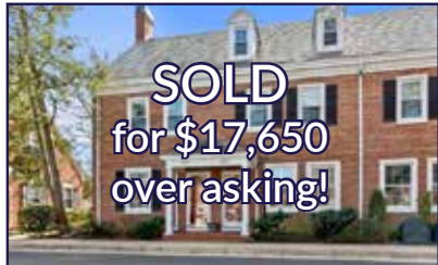
4310 35th Street S

Kay Houghton & Associates is a full-service real estate team that offers unique listing services, including staging & repair management, ALL for a reduced rate. Our clients save an average of $5,000 on Realtor fees before their home is even listed!