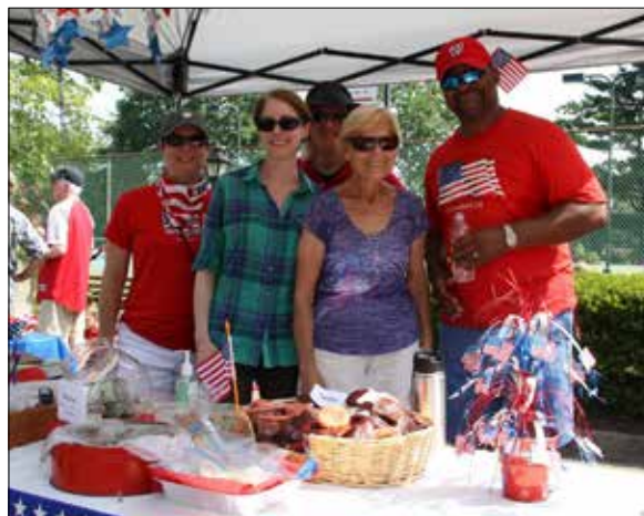
Volunteers at last summer's bake sale.

If you'd like to donate your favorite baked goods (please, no frostings or fillings to melt in the heat), deliver them