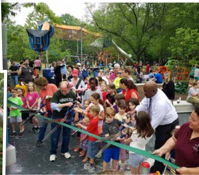
Children of all ages enjoyed the festivities as the Fairlington playground was officially reopened.