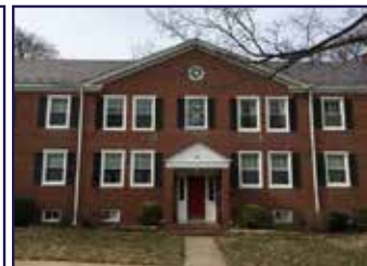
3532 S Stafford Street