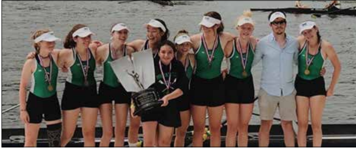
Wakefield Crew Girls Freshman 8 celebrate their first-place finish in the state competition.

The Wakefield High School Crew team will be sending the largest group ever to the SRAA National Championship Regatta in Ohio this year. The boats include Girls Junior 8, Girls Freshman 8, and Boys Lightweight 4 and Boys Varsity 2x.