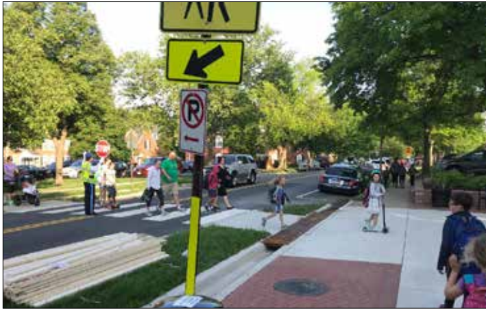
On May 8, children used bikes, scooters, and feet to get to school on time.

On May 8, Arlington Public Schools observed Bike, Walk & Roll to School Day. The sidewalks of Fairlington were filled with walkers, bikers, and scooters on their way to Abingdon and as far as Claremont Immersion School and Gunston Middle School.