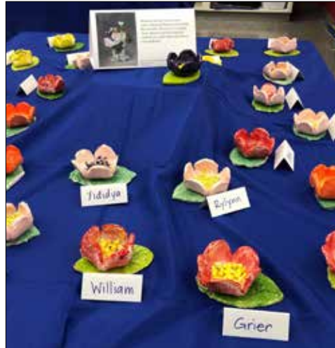
Kindergarten flower sculptures and second grade self-portraits on display at Abingdon Art Night.

Abingdon's second annual art show featured a school-wide art museum showcasing student works from the entire school year. Each student personally selected two 2-dimensional pieces for display, in addition to a 3-D clay sculpture made possible by the school's new kiln.