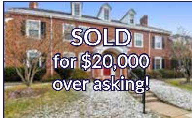
4204 36th Street S #A1

What could you do with an extra $23,000+?