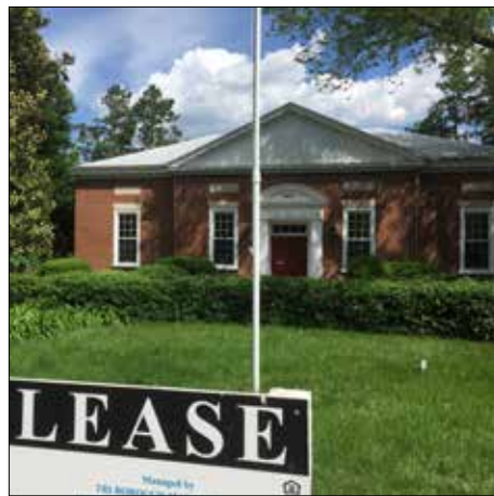
The former Long & Foster building is the site of one of two newly proposed child care centers in the neighborhood.

Developers have plans for two early childhood education centers in the Fairlington area, according to presentations made to the May 8 meeting of the Fairlington Citizens Association (FCA).