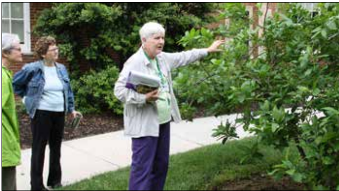
Fairlington residents gather to learn about native plants and trees during a grounds walk in May.