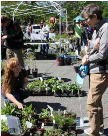
Residents took advantage of the native plant sale held in Alexandria in late April.