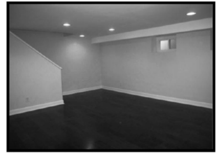
New Walls, New Ceiling, New Engineered Wood Floor