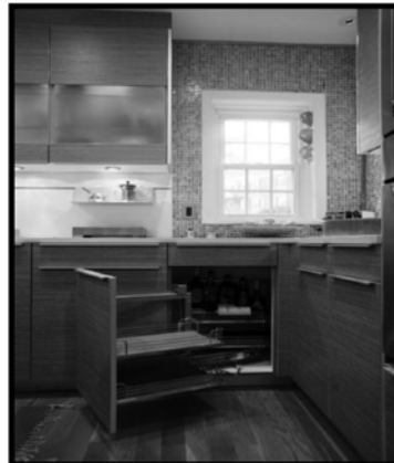
Poggenpohl cabinetry in a Mt. Vernon