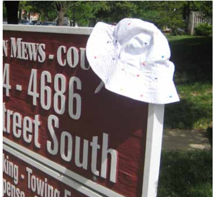
Department of Lost & Found, summer edition.

For an application or more information, contact the FBC via Google Groups at http://groups.google.com/group/fairlington-babysitting or by e-mail at fairlington.babysitting@gmail.com .