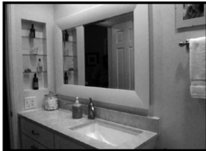
Elegant Clarendon Bath; Custom Vanity