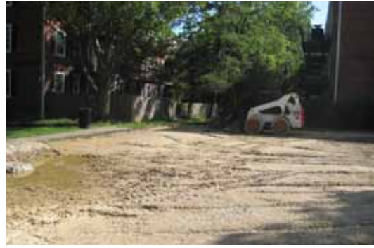
"Before" photo: A tennis court was removed from the Abingdon Street site, where a rain garden and other amenities will be installed this summer. "After" photos, to come.

Encouraging the building of rain gardens on private property is part of the county's larger effort to reduce the volume of storm water that crosses roof shingles, tarmac, concrete, and other impervious surfaces, enters directly, untreated and unfiltered, into a storm drain, goes to Arlington's streams, and empties eventually into the Chesapeake Bay. A rain garden serves to slow down the