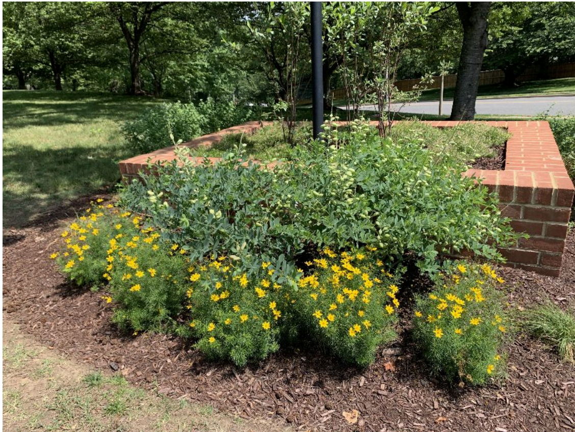
Dry tolerant native plants in a Fairlington Villages garden.