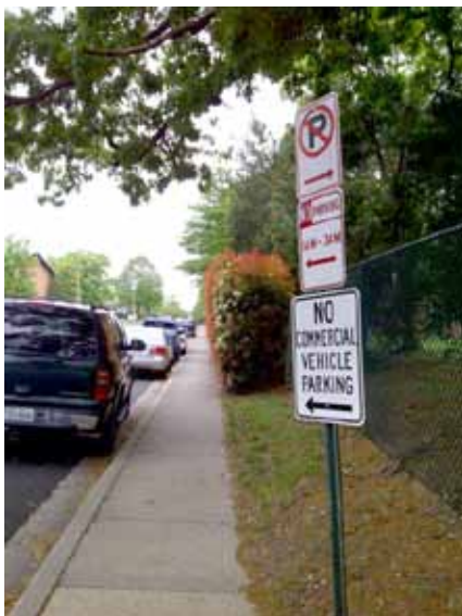
The curb on Quaker.

Quaker parking survey: Take the online survey to register your opinion about changing the current overnight parking restrictions on Quaker Lane. The survey will be open through July 8. Go online to the FCA Web site and follow the survey link.