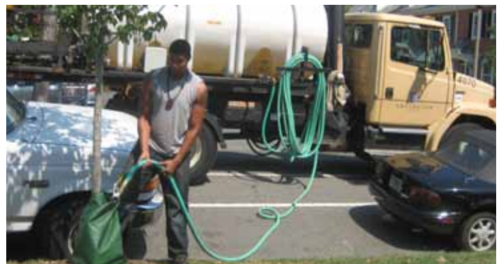
On a 90 degree day last September, county crews refilled the gator bags that irrigate drought-challenged street trees. Removed during winter, the gator bags reappeared in May.

At the Casey Trees Web site, caseytrees.org , you can check the homepage every Monday for a weekly watering recommendation throughout the summer.