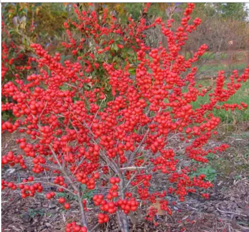
Photo from Gardenia.net of Dwarf Winterberry Holly (Ilex verticillata) 'Red Sprite.'