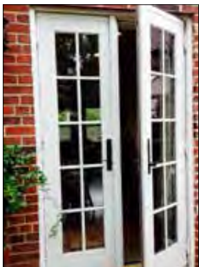
French doors open outward onto the patio

asked neighbors if she could see that feature. “Everyone was very accommodating!” she says.