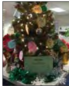
The Gift Card Tree at the Abingdon School will help those who need it most.