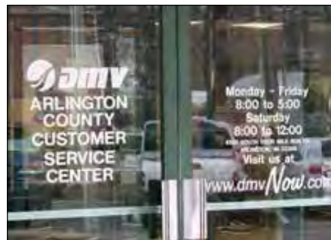
The doors of the Department of Motor Vehicles at Four Mile Run Dr. in Arlington will soon be closed for good.

The Virginia Department of Motor Vehicles recently announced that its facility at 4150 S. Four Mile Run Dr. in Arlington is slated to close this year and move to Fairfax County. The new location will be the Barcroft Plaza shopping center at 6345 Columbia Pike in the Falls Church section of Fairfax County, about four miles away from its current location.