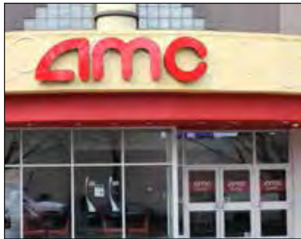
The AMC Shirlington 7 theater has comfortable recliners and reserved seating in which to relax while watching the latest films.

Anchored by long-time favorites such as the Carlyle Grand and Guapo’s, Shirlington now features more than