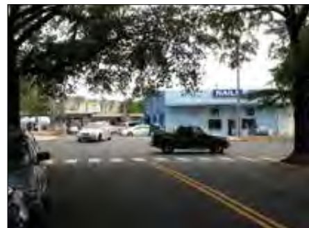
A car makes the precarious left turn from Quaker Lane onto S. 36th in Fairlington.