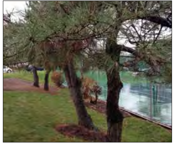
Black pines screen the Mews tennis courts on S. 36th St.

Colorado (or blue) spruce: Located behind the bus stop at the corner of S. 29th and S. Buchanan Streets. There's another southbound off the traffic circle median at S. 36th and S. Stafford Streets. What creates the "blue" look are silvery-white leaf pores, occurring in lines on each needle. Pyramidal, these trees are the perfect "stand-alone" specimens in a front-yard landscape. The bluish color is artistic in a standard "green" landscape.