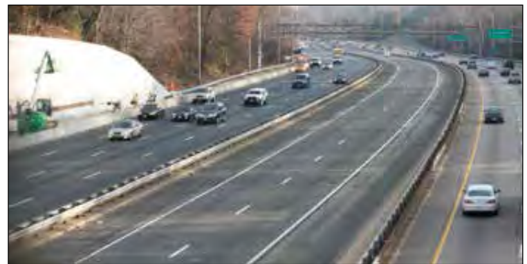
A view of I-395 from the South Abingdon St. bridge. The FCA is holding an informational meeting on the proposed HOT lanes project on January 25 at the 7 pm at the Fairlington Community Center.