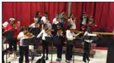
The Abingdon Strings add some music to the Holiday Shoppe festivities.

Gift Card Tree: Staff and parents donated gift cards to fulfill specific needs for selected Abingdon families. Their generosity helped ensure all could enjoy the holiday.