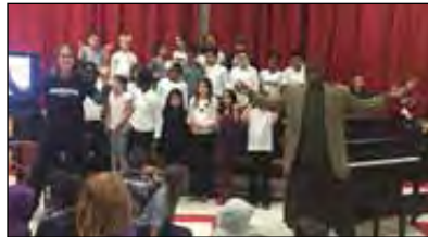
The Abingdon Glee Club sings from the heart for the holidays.