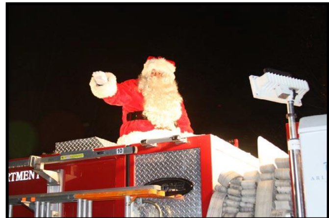
Firehouse Santa Ride