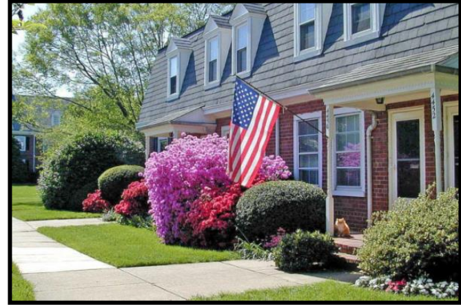
Home and Garden Tour