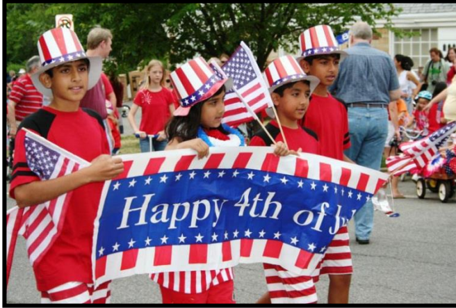
Fourth of July Parade