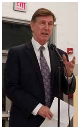
Rep. Don Beyer has previously spoken to the FCA on the issue of helicopter noise.

The 2020 National Defense Authorization Act as signed into law includes a provision which will require the Secretary of Defense to conduct a study on helicopter noise in the National Capital Region.