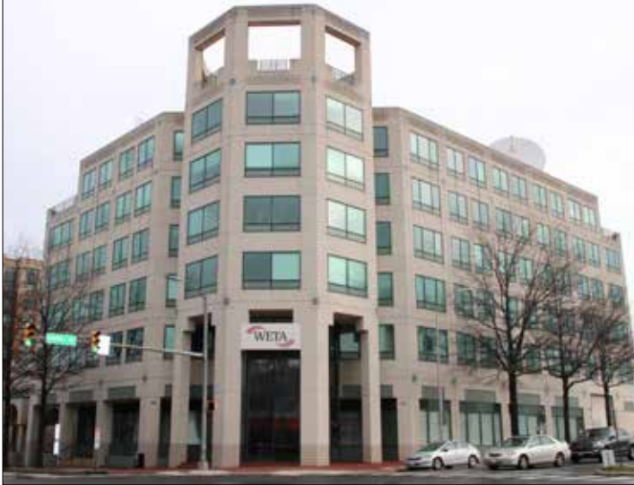
The WETA building at its current location on Campbell Ave. in Shirlington.

At its January meeting, the FCA Board unanimously voted to endorse the application of the Greater Washington Educational Telecommunications Association, commonly known as WETA, to expand their facility in Shirlington.