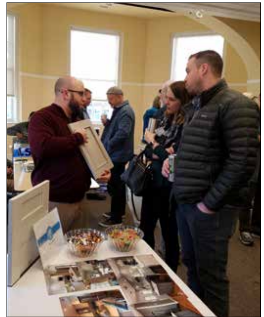
A contractor speaks to residents at the 2019 Showcase.

There may be space available for additional contractors to participate. If you have any recommendations for contractors who have done exceptional work