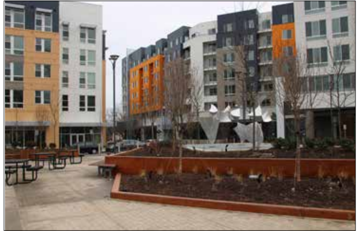
The interior courtyard at the new West Alex development.

The retail area is scheduled to be available for opening by April this year with over 100,000 square feet of retail space to be anchored by a Harris Teeter grocery store. The opening of the grocery store is still to be determined.