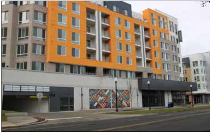
The Array is the residential apartment complex at the new West Alex development at the corner of King and Beauregard Sts.

The Array is their apartment complex with a variety of floor plans and pricing options. To schedule a tour or for additional information, visit their website: www.arraywestalex.com .