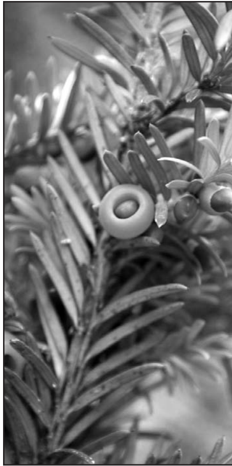
Yew berries.

Poison ivy. You know it is threatening just from its Latin name, Toxicodendron radicans . Poison ivy is not in the ivy, or Hedera , genus. The culprit in poison ivy is urushiol, a yellowish, oily allergen that irritates the skin. Leaves, sometimes shiny, grow in threes with the middle leaf the longest. In some cases, it looks like a lilac leaf. Poison ivy rapidly ascends trees, sinking its thick, reddish, hairy roots deep into the bark's longitudinal furrows, and its tenacity is just as problematic as its skin-irritant properties. Removing it can require a screwdriver or even the