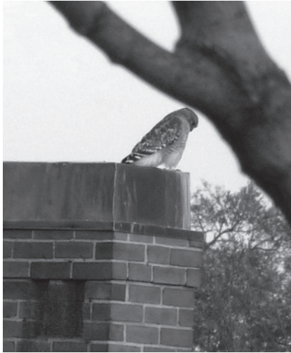
Hawk eyed: This red-shouldered hawk was spotted perched on a chimney in the Arbor on December 30.

an immense, detailed picture of winter birds. You can count birds for as little as 15 minutes on one day or for as long as you like each day of the event. Tally the highest number of birds of each species seen together at any one time, and then report the counts by filling out an online checklist at the GBBC Web site. You may also send in photographs of the birds seen—a selection of images is posted in the online photo gallery. Use the site's many participation tools to see, for example, how this year's numbers compare with previous years and what kinds of birds are found in Arlington, in Virginia, or in any participating location. It's free, fun, and easy—and it helps the birds.