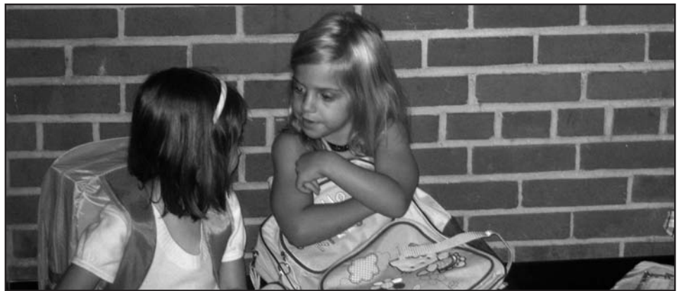
Calling all prospective Kindergarten parents! It's time for Arlington Public Schools' Kindergarten orientation sessions. Come see what Abingdon has to offer on February 24, March 8, or April 14.

The PTA will sell cheap eats—pizza for $1 a slice, snacks and drinks for 50 cents. We'd like to thank our good neighbors at the AMC Loews Shirlington 7 movie theater for donating real movie theater pop-