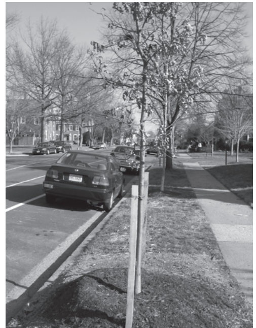
Staked striplings of pin oak, red maple, and London plane tree—replacements for storm-damaged trees—can be seen throughout Fairlington.

In the last several months, Fairlington has benefited from Arlington's commitment to renewing the urban forest, with special attention to replacing the county-owned street trees that were uprooted, broken, or damaged in the severe wind-burst storm of August 5, 2010. The Department of Parks, Recreation, and Cultural Resources, which manages Arlington's public trees, led the speedy clean-up after the storm and undertook the replanting effort. The county's Urban Forester, Dick Miller, conducted the assessment of Fairlington's street trees to determine each tree's health and prospects for survival or need for removal. PRCR's Forestry Section tree crew supervisor, Tony Ruth, supervised the subsequent pruning and removal of too-badly-damaged trees.