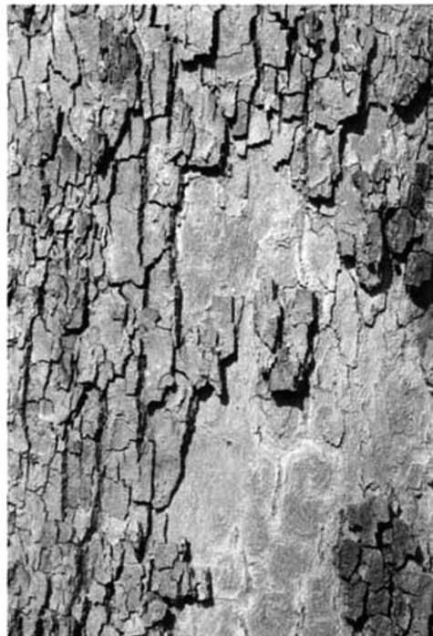
London plane tree bark