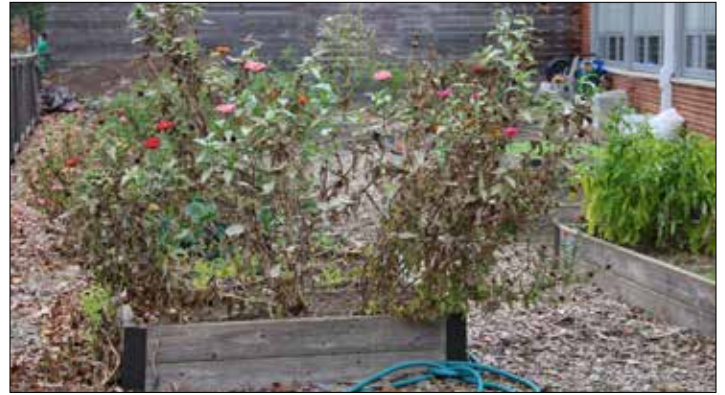
All community members are invited to help clean up the Abingdon Community Garden on Monday, January 16.

Additional details will be provided in the January issue of the Bulletin. This will be the first time FCA has sponsored a community-wide volunteer activity to honor the civil rights leader.