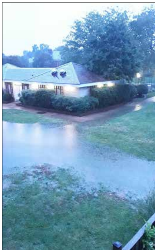
Rainstorms flooded parts of Fairlington Arbor in August 2021.

Residents can help increase permeable surface. For