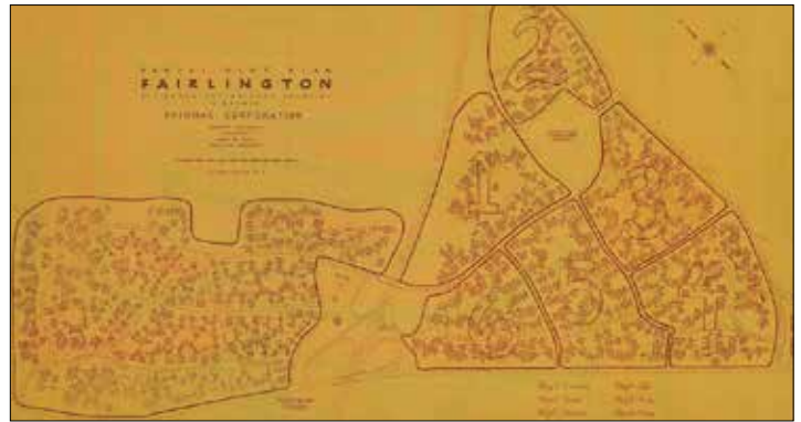
Architect's map of Fairlington.

Franzheim for the Defense Homes Corporation and subsequently revised for Fairmac, the firm that managed the post-World War II rental community from 1947–1978. The map was updated by CBI Fairmac, the firm that oversaw the conversion to condominiums in 1982–1978, and later revised by FHS to better define the villages.