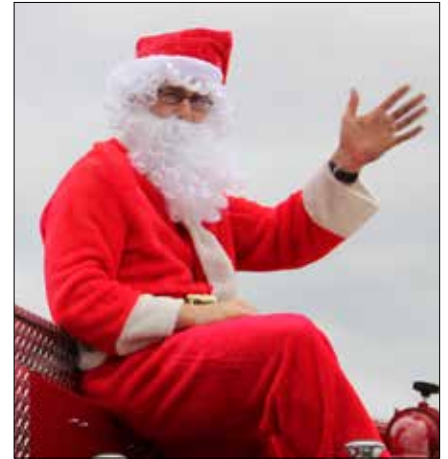
Santa waves to crowds of eager children during the 2021 parade.