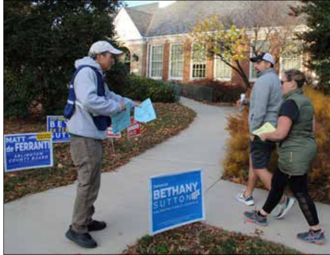
Volunteers help get out the vote outside of the Fairlington Community Center on Election Day 2022.