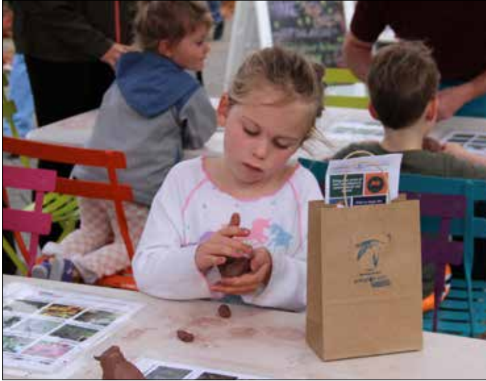
Young art truck participants work on their sculptures of Arlington's threatened birds.

With a focus on threatened birds in Northern Virginia, the popular Arlington Art Truck made its third visit this year to the Fairlington Farmers Market in November. The art activity, which drew a steady stream of Fairlington residents, saw participants create a "seedbird" sculpture