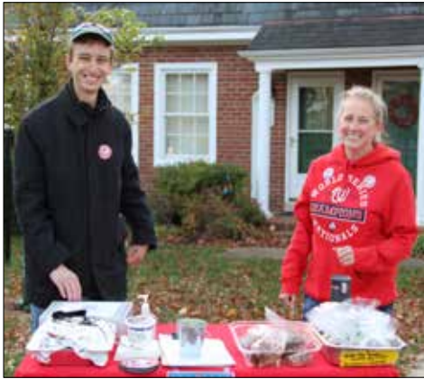
The Abingdon Elementary PTA sells baked goods on Election Day to raise activity funds.