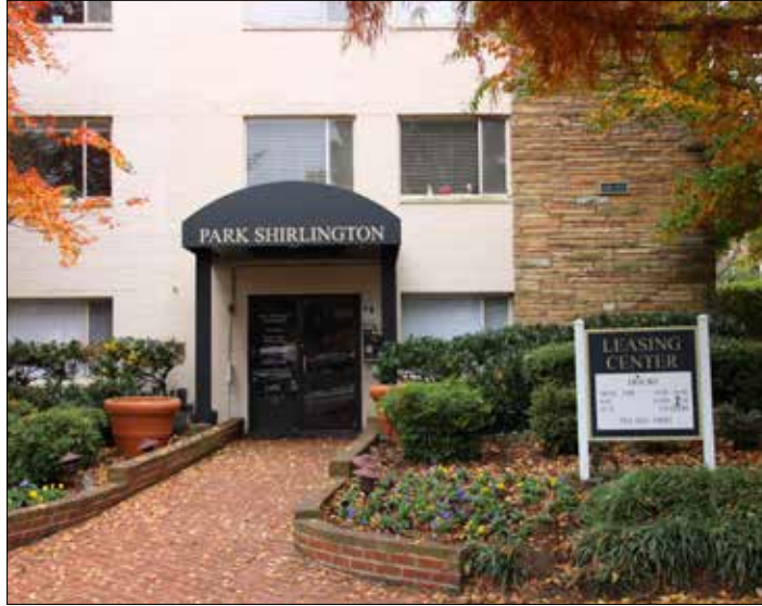
The renovation of Park Shirlington apartments will maintain the current number of apartments and is expected to take about two years.

The apartments will be available for residents whose household income is no more than 60 percent of the area median income. In this area, that is about $85,000 for a household of four people.