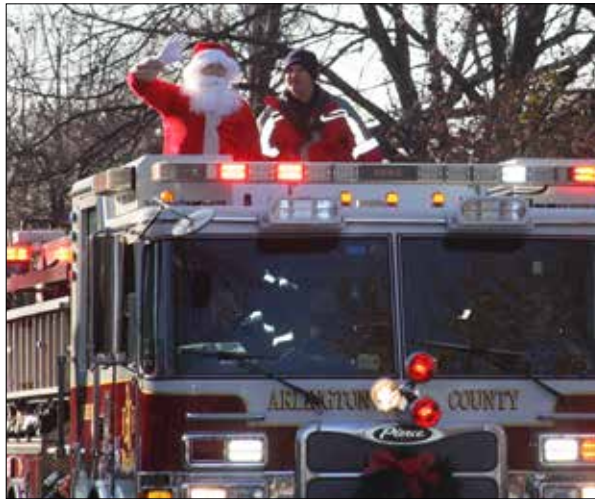
Santa Claus will be making his annual trip through Fairlington, this year hosted by Fire Station 9 based on Walter Reed Dr.

The permanent closure of Fire Station 7 will not stop Santa and his fire-fighting elves from visiting Fairlington this year! Please give a warm welcome to the crew from Fire Station 9 (located at the top of Walter Reed hill) as they keep this wonderful community tradition going.