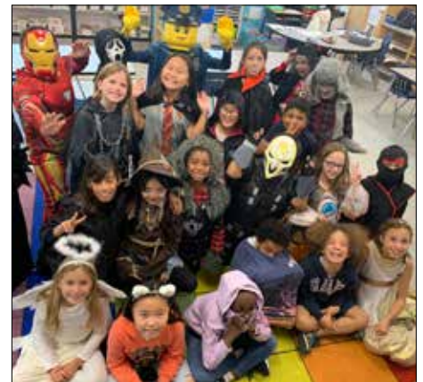
Students in 3rd grade celebrating Halloween in their classroom.