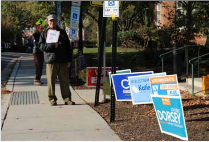
Election Day 2019 in Fairlington saw clear skies, voters, volunteers, and lots of campaign signs.

On Tuesday, November 5, Virginia held its general election. Most of the offices on the ballot in Arlington and Alexandria were races in which the incumbents were running unopposed.