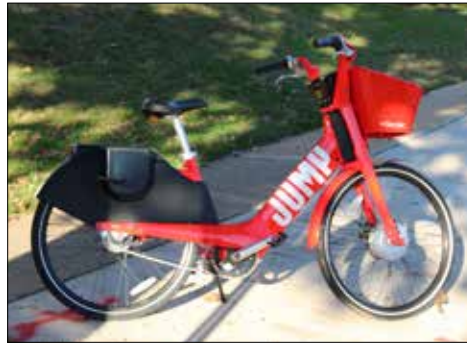
Arlington and Alexandria have taken steps to further regulate dockless mobility devices like this ebicycle, recently parked at the corner of 31st and Abingdon Sts.