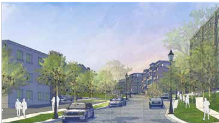
An artist's rendering of the site of the redevelopment of Park Shirlington shows the future 31st St.

This meeting followed up on a presentation held at the County Trades Center in Shirlington in October and a November 12 meeting hosted by FCA for residents of Park