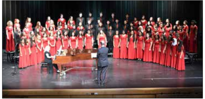
The Wakefield High School choir performs on December 17.