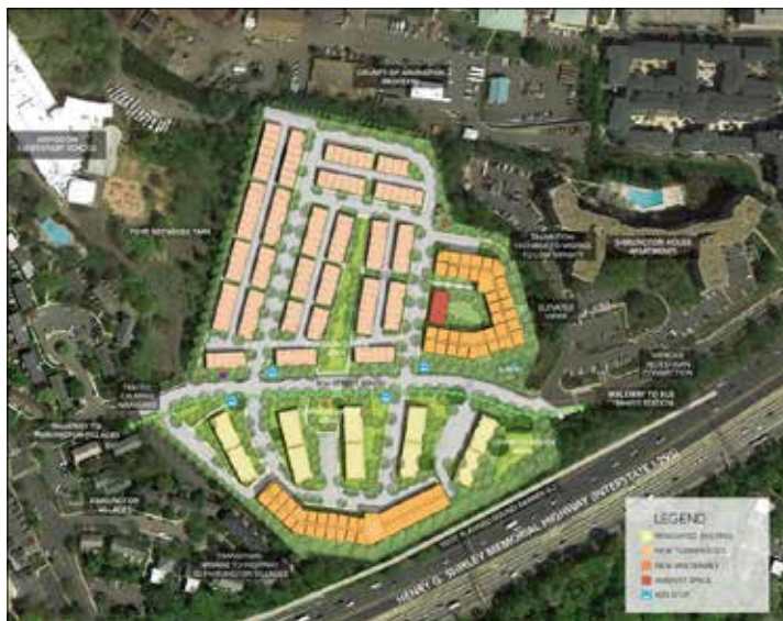
This map shows the plan for the redevelopment of Park Shirlington.

KGD Architecture has provided representational visuals of the planned development, but emphasized that no architectural style has been chosen yet, and the structures will look different in the final proposal submitted to the county. The new homes will not mimic Fairlington’s distinctive style, but will be designed to complement it to give a sense of connection between the two communities.