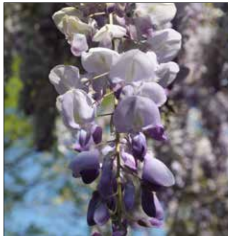
Wisteria offers lavender flowers, but also requires maintenance.

Star jasmine is another shade lover that bears white, fragrant flowers on an evergreen blanket. All these are easier to contain since they are herbaceous (meaning non-woody) in the stem.