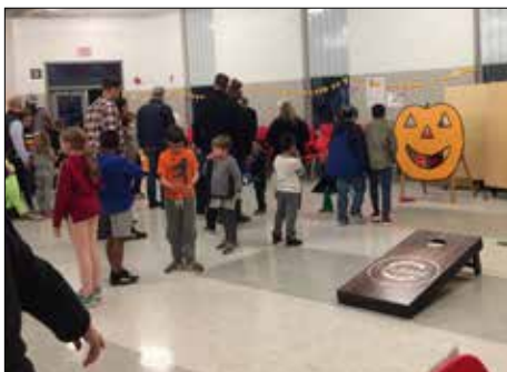
Students playing games in Abingdon's cafeteria at the Fall Festival.

This year's Fall Festival, which is organized by the Parent-Teacher Association (PTA), was a success. In the gym, there was Halloween-themed music playing for students