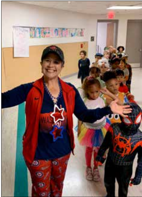
Halloween celebration inside Abingdon.

Due to the forecast of rain and thunderstorms on Halloween this year, Abingdon's Halloween parade was cancelled. This didn't dampen