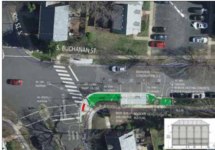
This graphic shows the design of the county's proposed bus shelter on S. Buchanan.

All work will occur within the county right-of-way