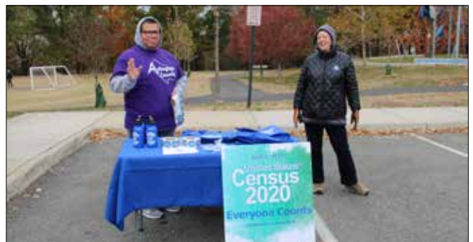
Census workers answer questions at the Fairlington Farmers Market in advance of the 2020 U.S. Census.