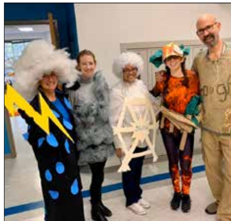
4th grade teacher's costumes for the Halloween celebration.

enthusiasm for the holiday, however, as many students and teachers wore costumes to school and celebrated in their classrooms.