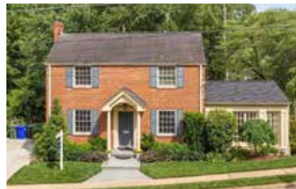
3529 N Utah St Arlington, VA 22207 4BR/3.5BA Under Contract! Listing price $1,495,000 Listing Agent Megan McMorrow