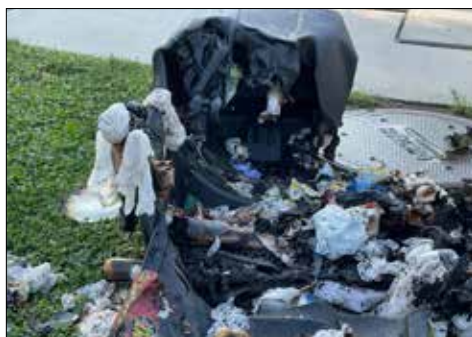
A melted trash can found near the Fairlington Community Center in South Fairlington.

Arlington County fire officials are investigating a recent rash of incidents involving trash can fires near the Community Center in South Fairlington. If you see anything of concern or any suspicious behavior please contact the Arlington County Fire Department at 703-228-4644.