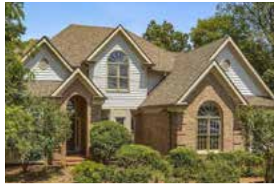
3501 W Ox Rd Fairfax, VA 22033 4BR/3.5BA For Sale! List price $1,045,000 Listing Agent Kathy Koerner