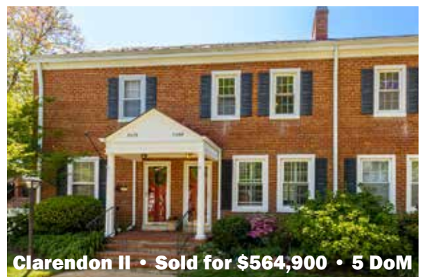
Clarendon II • Sold for $564,900 • 5 DoM

202.557.0311 Lauren@LaurenKolazas.com www.LifeAfterFairlington.com