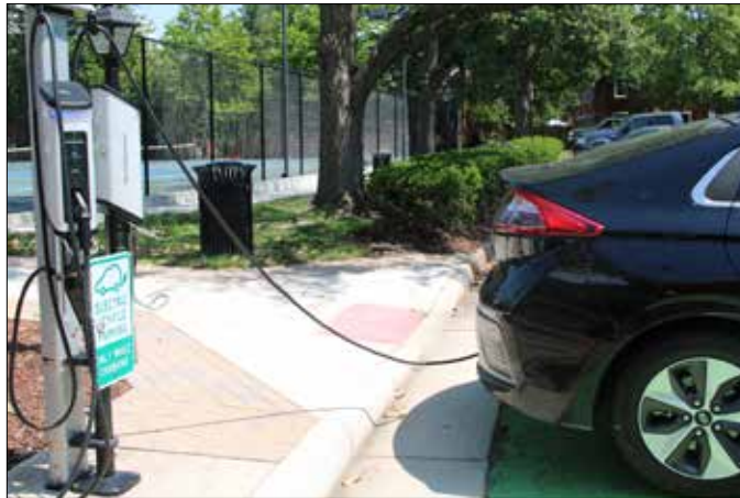
Electric car is hooked up at the charging station in the North Fairlington Community Center parking lot.

This will be a starting point for determining the location of new charging stations, along with any public hearings that the county could schedule in the coming year.