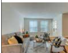
3341 S Stafford St | For Sale $574,900