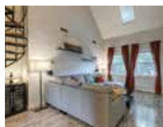
4650 36th St S #B2 | Under Contract!