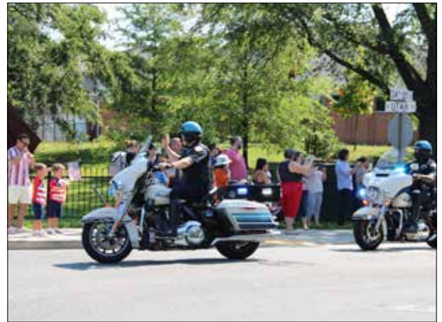
A police officer waves to parade-goers from his motorcycle during the 2021 Fourth of July parade.

The two firetrucks and an ambulance were led by two police motorcycles and began the parade at Abingdon Elementary. After winding through North and South Fairlington, the parade ended at the Fairlington Community Center on the south side.