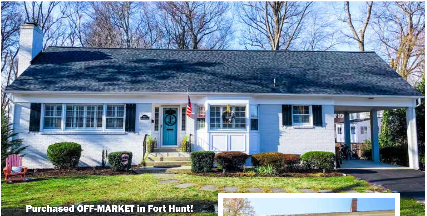
Purchased OFF-MARKET in Fort Hunt!

As a former Fairlington resident and mother of three, I know that leaving Fairlington can be hard.