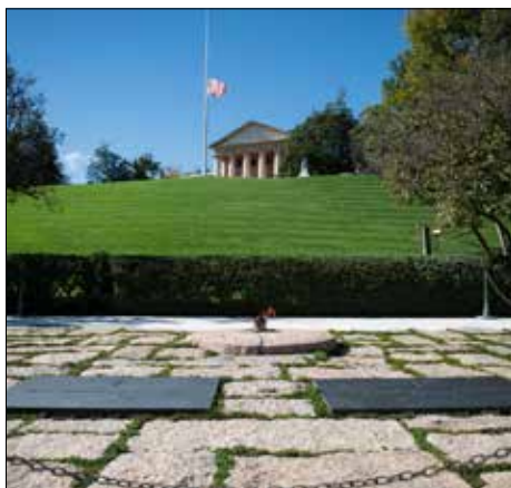
Sedum ground cover fills the spaces between the stones surrounding the gravesites of the Kennedy family.

JFK gravesite: Sedum ground cover fills spaces between marbled, gray stone surrounding the graves of President John F. Kennedy, his wife, Jacqueline, son Patrick, and daughter Arabella. Moss and fescue (a grass) also have been planted in those hardscape crevasses. The stone is cut to fit around a circular granite platform which houses an eternal