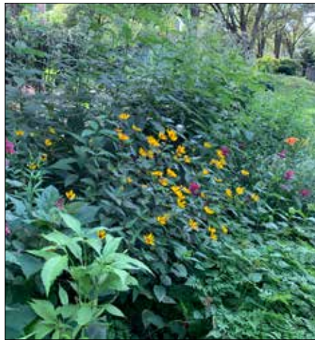
Rain garden in Fairlington Villages.

One inch of rain on a 500 square foot surface amounts to more than 300 gallons of water. The week of June 8 we had four inches of rain, so that same surface had more than 1,200 gallons of water fall on it. Now multiply that by every roof in Fairlington, every tennis court, pool deck, parking lot, sidewalk, patio, well, you get the picture—that is a lot of water. And every drop of it carries pollutants from the air itself and the surfaces it touches directly into the storm drains, where it continues, unfiltered, into our local waterway, Four Mile Run, and from there to the Potomac River and the Chesapeake Bay.