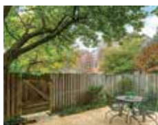
3008 S Abingdon St #A2 | Sold $500,000