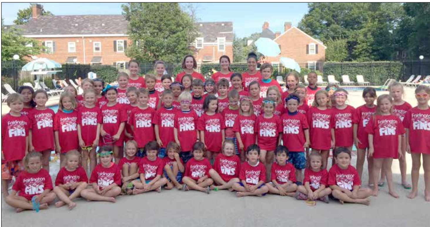
The 2016 Fairlington FINS (Fairlingtonians Interested in Neighborhood Swimming) gather for a group photo at session in July. The FINS program is a regular summer fixture in Fairlington and is a fun way for kids to strengthen swim

skills, and encourage camaraderie and good sportsmanship. The program ran for for three weeks from July 11 to 29.