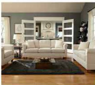
Sofas & Sectionals

Options include over 200 in-stock fabrics, fitted slipcovers, arm covers, cushion styles, and much more.