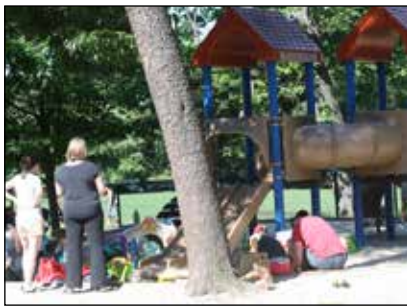
The playground at Fairlington Park will be a focal point of the renovation project.

The updated design shared by the county on June 29 incorporates feedback from the citizen survey conducted in the spring. The online survey received 342 responses. Survey respondents named the Utah St. entrance as the most frequently used access to the grounds. The county has modified the design to add new shrubs and flowers to enhance that entrance.