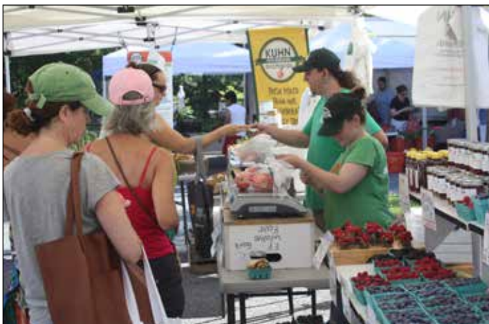
Customers line up at the Kuhn Orchards stand at the Fairlington Farmers Market.

One example is this year's Kuhn Orchards' cherry crops. April's cold temperatures destroyed nearly all of the blossoms; the fruit that did form from the very small percentage of surviving blossoms left about 10 individual cherries on each tree. Kuhn Orchards reached out to a neighboring orchard who was able to grow tart cherries