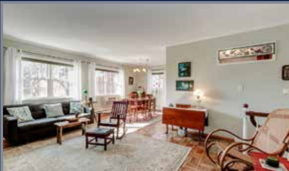
SOLD - 1626 PRESTON ROAD - $220,000 Alexandria