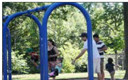
Concerned parents have pushed to maintain regular swings at Fairlington Park because of their popularity. Revised county plans will include a set of standard swings.

being installed near the current drainage site on the northwest side of the property.