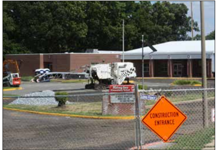
The main entrance to the school site.

ing utilities to the classroom trailers, which have been placed on the area that was previously the playing field. APS plans to have 18 of the relocables on the site. These will be used for classes when various parts of the building are being renovated.