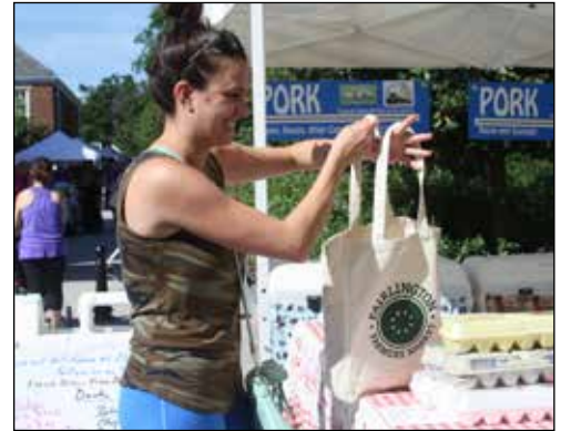
Shop in style at the market with the new Fairlington Farmers Market tote bag! Get one while they're still available; $7 at the market information booth.

that meet their standards, and with permission from market management brought this crop to the market to meet the demand for tart cherries that are not available in the grocery stores. While sweet cherries and apricots were additional casualties of the cold spring weather, 50 percent of Kuhn's peaches and nectarines survived, so you're seeing a good supply at the market. Blue Italian plums and Asian Pears will be available this summer, but in limited quantities.