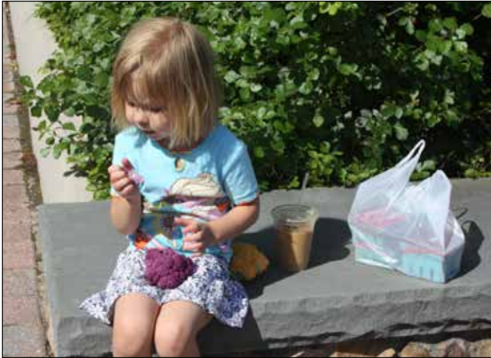
A young Fairlington Farmers Market patron partakes of some fresh cauliflower.

The unseasonably cold spring weather may be a distant memory, but it had a significant impact on fruit and vegetable crops from local farmers, such as market vendors Kuhn Orchards, Pleitez Produce, and Spring Valley Farm and Orchard. While our vendors have a wide variety of fresh summer produce, you may have noticed shortages of certain items, or some higher prices.