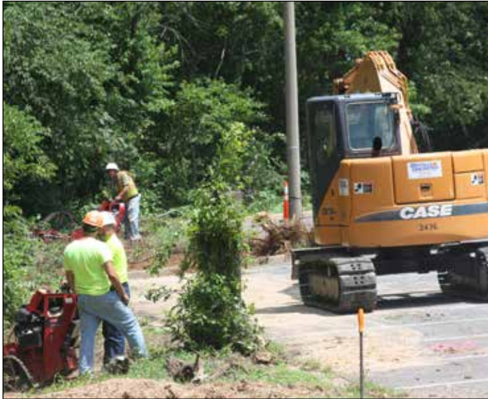
Construction workers do prep work at the Abingdon Elementary School construction staging area.

In addition to the construction work, Arlington Public Schools (APS) has moved in additional portable classrooms (relocatables). In July, workers were connect-