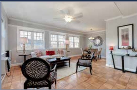
SOLD - 3214 GUNSTON ROAD - $302,000 Alexandria