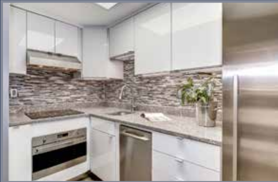
SOLD - 1731 WILLARD ST, NW #101 - $385,000 DC / Adams Morgan

A Different Approach... Working for YOU!