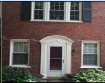
SOLD IN 2 DAYS

2700 13th Road S. 2 BR, 1 BA, Arlington Village