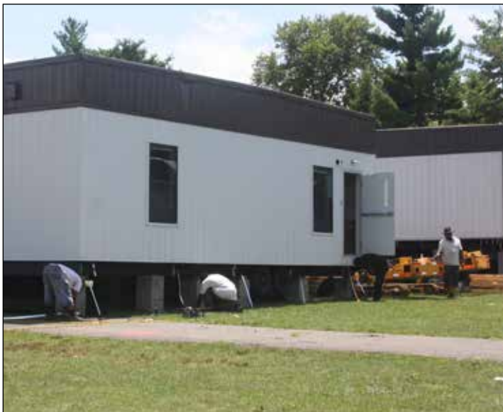
The portable classrooms get some attention from the crew working at Abingdon.