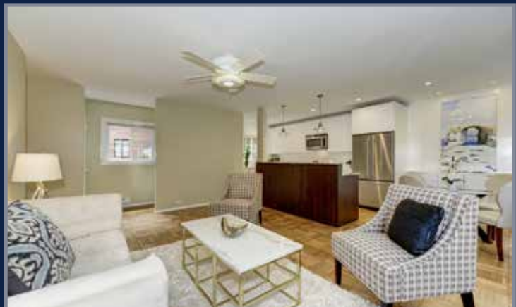
ACTIVE - 1731 PRESTON ROAD - $262,000 Alexandria

THINKING ABOUT MAKING A MOVE? CONTACT ME TODAY!