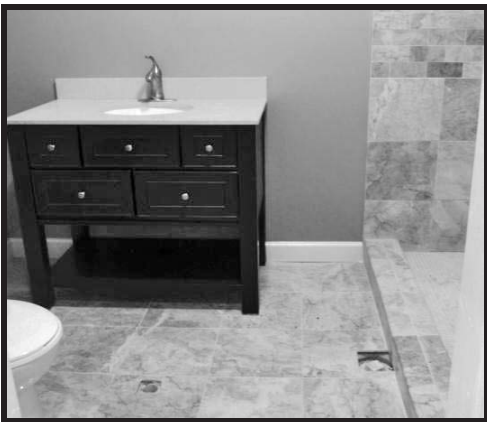
Lower Bath- New floor plan!