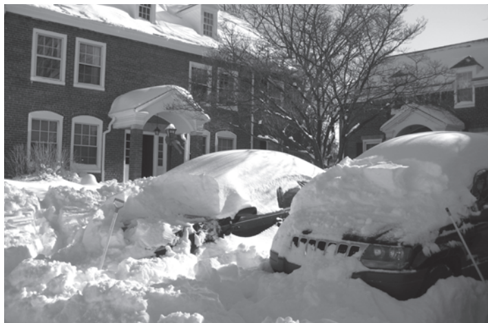
Weather comes in all flavors—like, February.