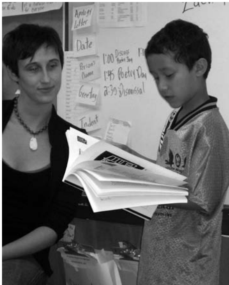
Students read their poetry aloud to classmates, teachers, and parent-guests.

The last couple of weeks of school were busy ones for Abingdon students, teachers, and parents. On June 17, Abingdon held its Poetry Anthology Release Party. Throughout the year, students in every grade participated in a special learning experience centering on poetry. Working with the Kennedy Center's Changing Education Through the Arts program, Abingdon teachers developed a year-long curriculum culminating in a school-wide poetry book. All students learned how to write and appreciate poetry. Students in grades two to five also studied art from the Smithsonian's American Art Museum to inspire their writings. Thanks to the generosity of our community, which made the Abingdon PTA's