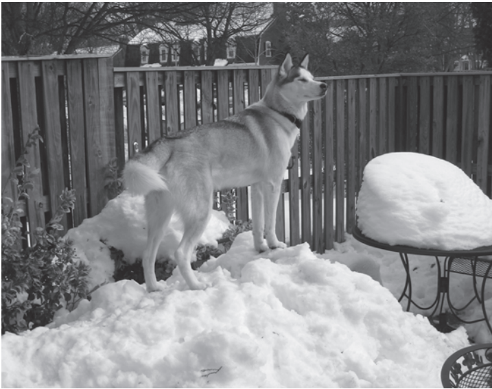
The dog days of....February.

NOTE: There is no FCA meeting in August.