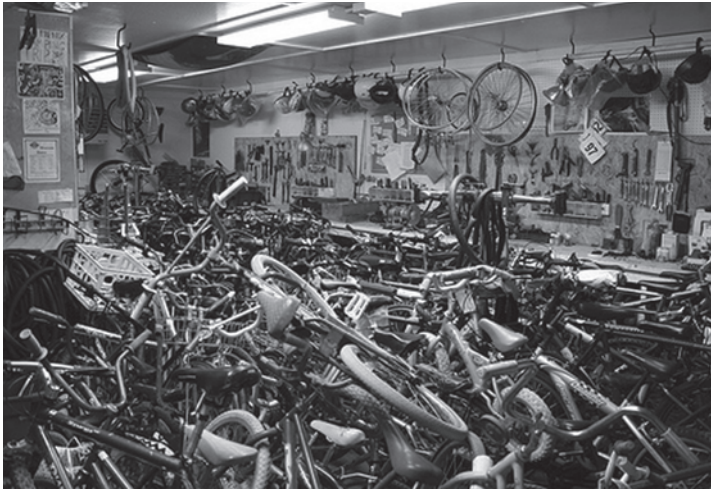
Phoenix offers budding mechanics a chance to earn their own bikes.

The Phoenix Bike Shop on nearby Four Mile Run Drive is more than just a bike repair and sales store, where you can get a low-cost tune-up or find a quality used bike. Phoenix Bikes is also a community mentoring project—an after-school youth development and leadership training program. As part of Phoenix's Earn-A-Bike program, teenage intern mechanics spend after-school hours learning the basics of bike mechanics and maintenance, as well as business skills, as they work their way toward earning their own bike. They also tackle new problems in the shop, go on BMX and road rides with the Phoenix team, and work with adult role models in the shop.