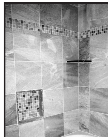
Marble & Mosaic Bath