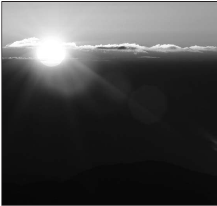
Relentless sun and heat challenge garden plants.

There's a reason customers don't contact me in July and August to plant flowers or shrubs—it's hot. And new plant roots struggle to become established when the soil is dry and water is minimal. That's especially true this year. In June, we had 18 days when it was 90 degrees or above. (Last year, there were two such days.) In late June and early July this year, triple-digit extremes began to seem common—five days when the mercury reached 99 and above, with a record-breaking 102 on July 7—and the area recorded sultry 90+ temperatures in 17 of 21 days.