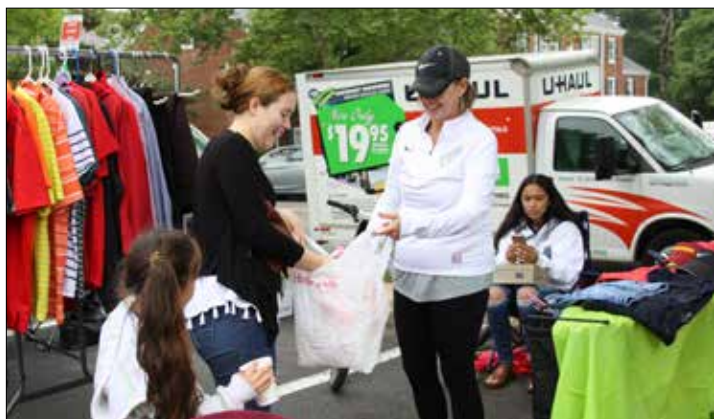
The annual Fairlington Villages yard sale attracts shoppers from all over the local area.

Come see what your neighbors have to offer at the Fairlington Villages annual spring yard sale. It will take place on Saturday, April 30, from 8 a.m. to noon at the