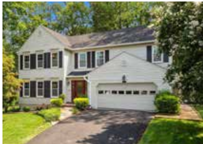
Mount Vernon Condo to Fairfax Station