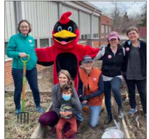
The Abingdon Cardinal thanks our school garden volunteers at Winter Wonderland for their hard work.