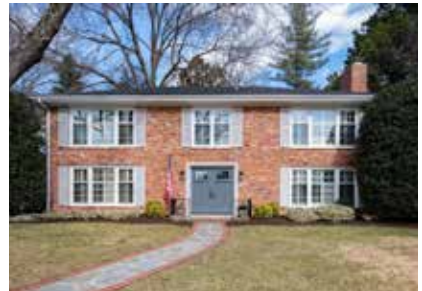
Clarendon I Townhome to Fort Hunt

Contact us for a no-obligation consultation today!