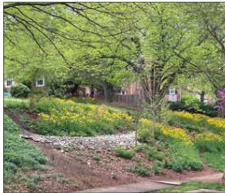
The Utah St. hill in Fairlington Commons was transformed from eroded hillside to native plant gardens. This view of the 2017 StormwaterWise project includes a rock berm to slow stormwater.

The landscape contractor did the heavy work of removing the turf and weeds; creating any swales, berms, or rock spillways needed at the end of gutter pipes; spreading topsoil, topsoil amendments, and mulch; and planting any large shrubs or trees. The grounds committee planted the native perennials each year, ranging from