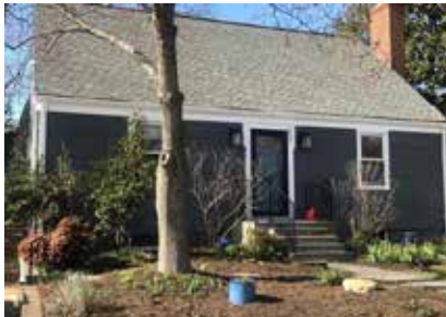
Clarendon II Townhome to Claremont