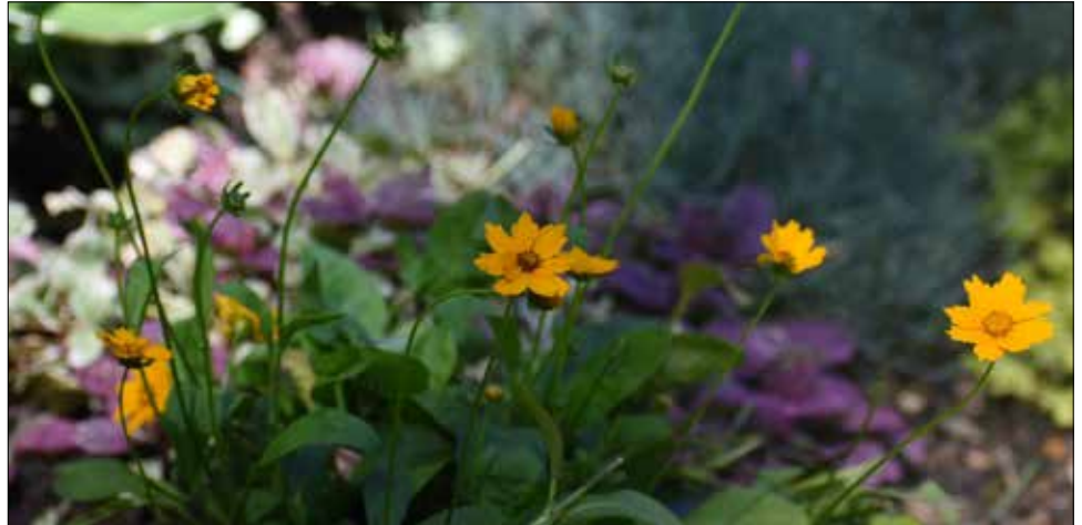
Bright yellow coreopsis provide low maintenance blooms all spring and summer long.

As always, evergreens are a smart choice since they provide year-round beauty. Take a look at dwarf English boxwood, pieris (white flower in March-April), euonymus, juniper, azalea, rhododendron, lenten rose (ivory and mauve flower in three seasons), and barberry. These all fit (size-wise) into a Fairlington garden. As for pruning,