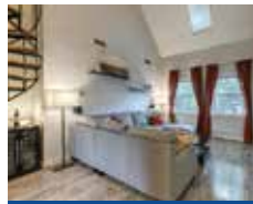
4650 36th St S #B2 | Under Contract!