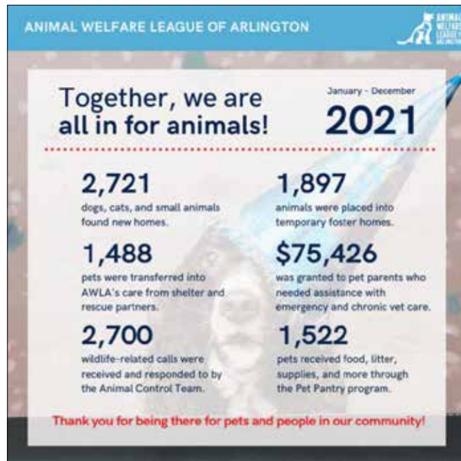
A slide from the AWLA presentation at the FCA meeting shows 2021 successes.