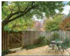
3008 S Abingdon St #A2 | Sold $500,000