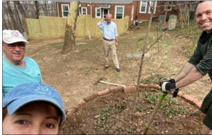
The Fairlington Commons ground committee takes advantage of the spring weather to take care of new trees.

When a tree is planted, a water bag will be placed around the tree for the warmer seasons and the county will maintain the filling of the bags. Any help from residents with watering is appreciated and will improve the chances of young trees to thrive. The water bags are not needed in colder months and will be removed. Any urgent tree maintenance requests should be reported using the county's Report a Problem tool: https://www.arlingtonva.us/Government/Topics/Report-Problem .