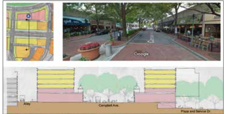
This graphic shows the proposed height increases of the buildings along Campbell Ave.

Another area to build that garnered some support would be over the existing Shell station with an additional eight to ten stories, allowing for more of a barrier from I-395 and the traffic circle. There was broad consensus that the tiered parking garages could use a facelift by placing screening over open spaces to create a more unified look.