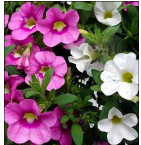
Petunias are one of the many annuals that do well in a sunny spot.

Vines: Selection is minimal but I like star jasmine (white, fragrant flower), clematis (white, lavender, or purple flower), carolina jessamine (yellow, bugle-shaped flower), trumpet vine (orange flower) and wisteria (lavender flower). Vines run so they will need pruning. They are ideal for a trellis.