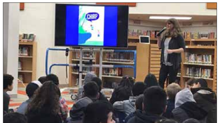
Author Kate Messner speaking to Abingdon students.

Ms. Messner also shared with the students that a key to being an author is to “read a ton and carry a writer's notebook everywhere.”