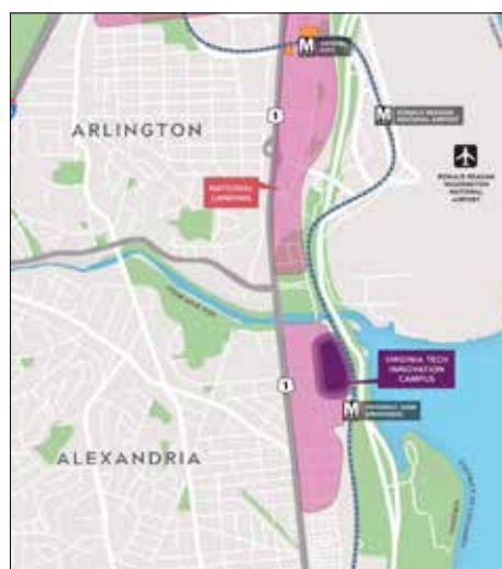
This map shows the location of the new Virginia Tech Innovation campus.

The Virginia Tech Innovation campus came about as part of an agree-