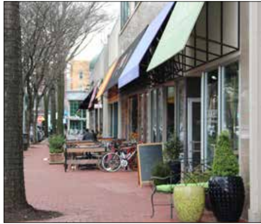
The importance of preserving the character of Campbell Ave. was a consensus view of the LRPC.

On February 19, members of Arlington County's Long Range Planning Committee (LRPC) convened its penultimate meeting regarding the Shirlington General Land Use Plan (GLUP) study. Committee members include reps from Fairlington, Shirlington, and Green Valley Civic Associations; Shirlington property owners Federal Realty Investment Trust (FRIT) and WETA; as well as county staff from the Departments of Environmental Services, Parks and Recreation, and Community Planning, Housing and Development. Representatives from the Housing Commission and Historic Preservation were also included.