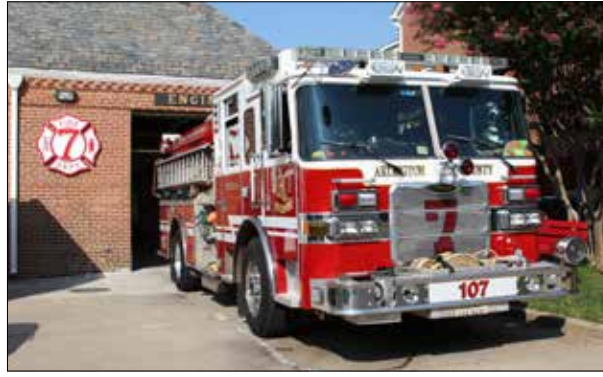
Fire Station 7 has been closed for structural issues since October, 2018.