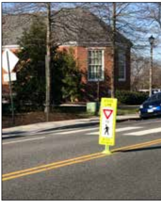
The crosswalk on S. Stafford St. in front of the FCC now features a mid-block pedestrian marker.

As has been previously reported, the intersection of S. 34th Street and S. 36th Street will be re-configured to shorten the length of the cross walk along S. 34th Street and slow down east bound traffic turning onto to S. 36th Street. Last year, the County conducted a study and determined that vehicular traffic would speed up over the 395 bridge and take a wide turn onto 36th Street, making that corner of particular concern. At the time of this writing a final traffic survey is underway.