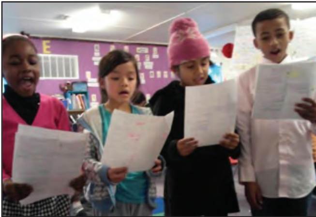
Abingdon students read poetry to visitors on Arts Integration Day.

On February 21, the staff and students of Abingdon Elementary hosted hundreds of parents and members of the Kennedy Center CETA (Changing Education Through the Arts) program for its annual Arts Integration Day. Abingdon's value-