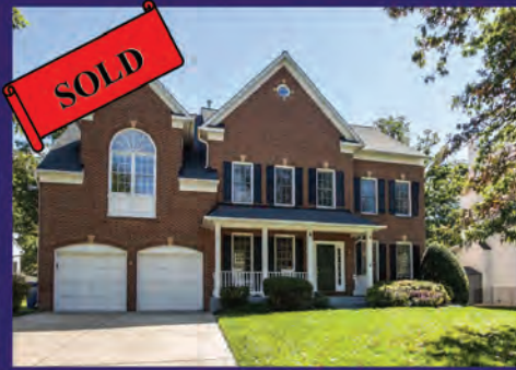
Victoria Oaks 5921 Ewing Place, Alexandria