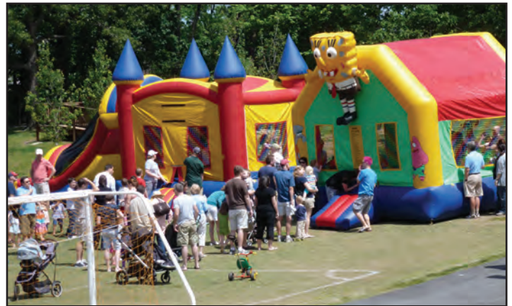
Families came out to enjoy the sunshine and fun activities at Fairlington Day in 2012.