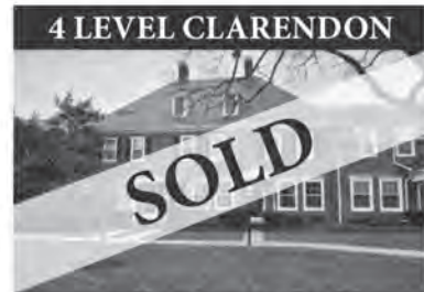
4 LEVEL CLARENDON