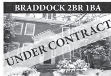
BRADDOCK 2BR 1BA