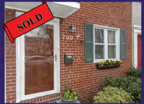
Old Town 730 S Alfred Street, Alexandria