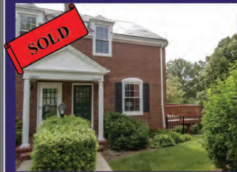
Fairlington Commons 3327 S Wakefield Street, Unit B